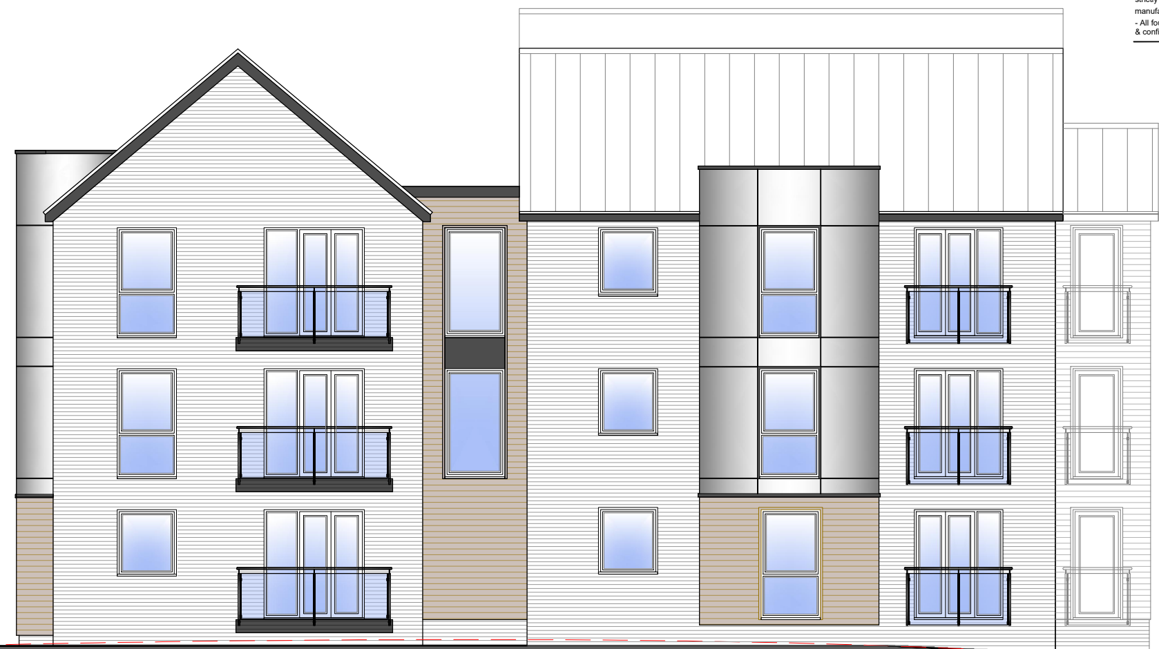
WEST ELEVATION - BUILDING C